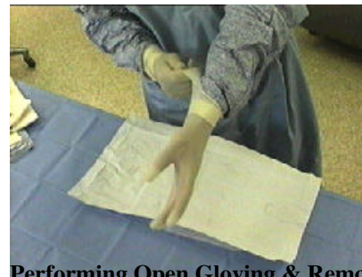
Performing Open Gloving & Removing